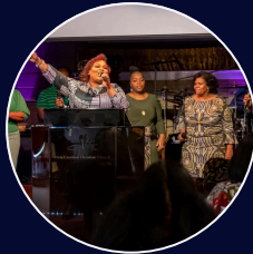
E.T.M. of Christ, Int'l Music & Arts Ministry Worship Ministry